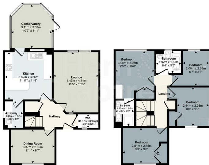
Ground Floor Approx 62 sq m / 663 sq ft